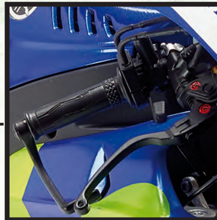
The handlebars and controls are reproduced down to the smallest detail