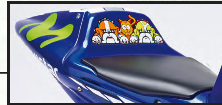
Rear cowling with custom decals and soft plastic seat pad