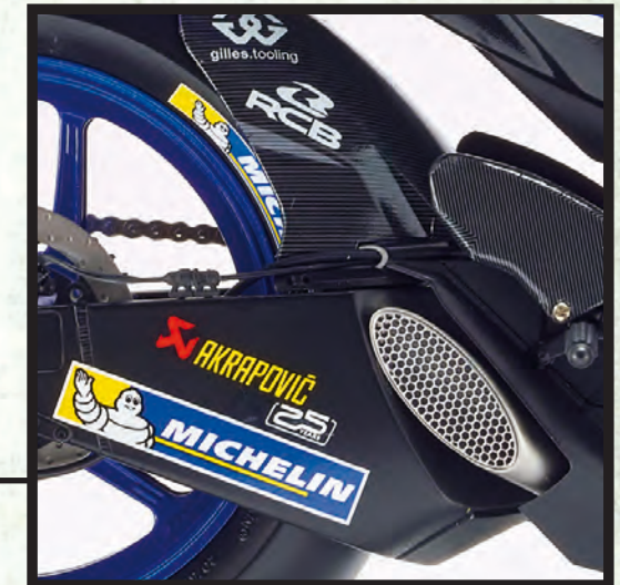
The swingarm reproduces the travel of the real suspension