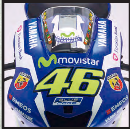
Pre-painted fairing with race number and logos perfectly reproduced