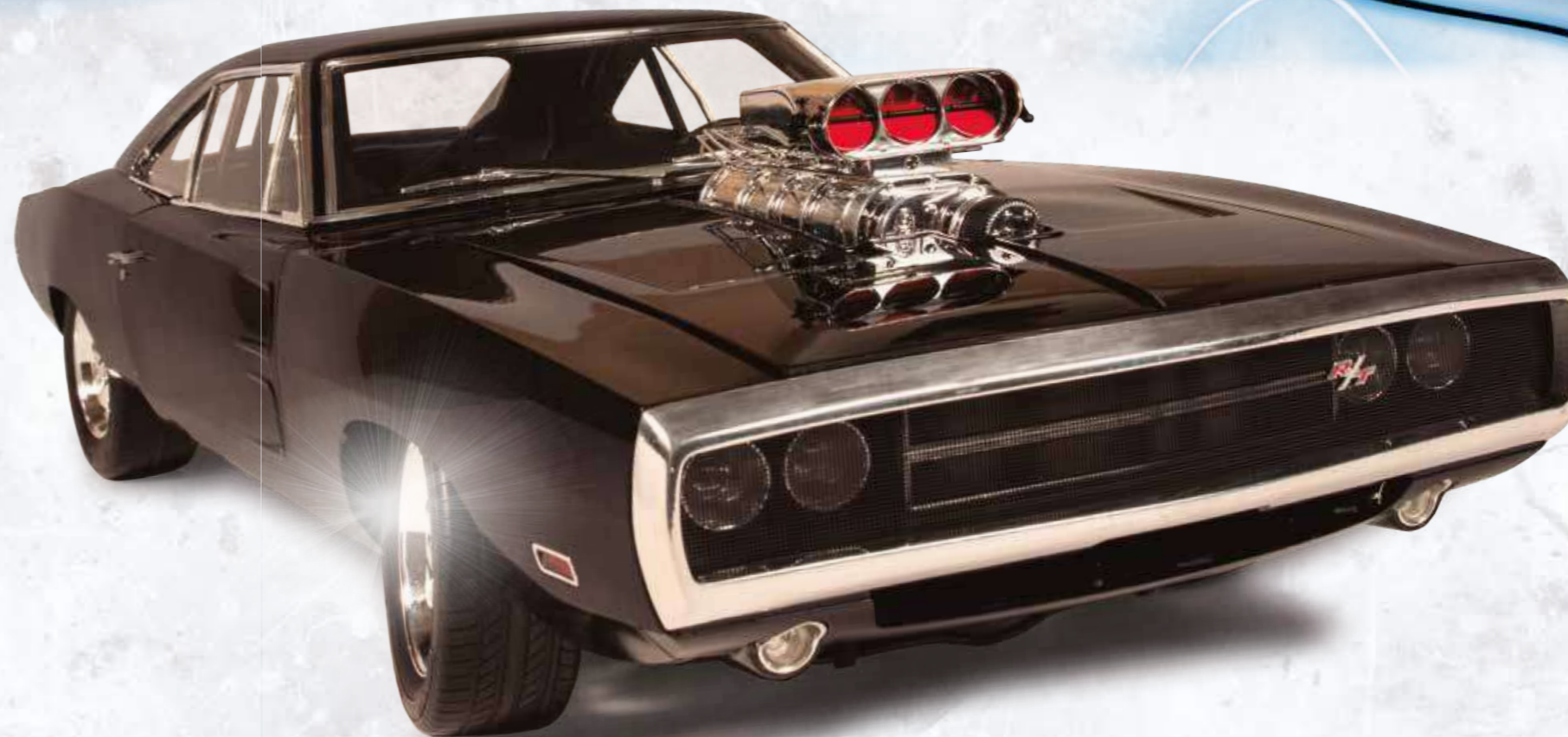
The Dodge Charger R/T is the most popular car in the world of Fast & Furious .

Now, more than 15 years after the release of the first movie in the franchise, we offer you the chance to join the crew with a unique new collection. Enter the world of Fast & Furious to learn all the details of this phenomenon: technical data, anecdotes, replicas, and its unique moments... And, you will do so as you assemble an exclusive detailed 1:8 scale reproduction of the Dodge Charger R/T – undoubtedly the dream of every aficionado of the modeling and the motoring worlds combined.